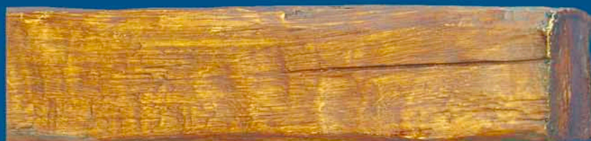
90002 (350X14X11.5cm) ( 137\frac{13}{16} X 5\frac{1}{2} X 4\frac{1}{2} )