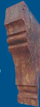
68818 (46X12X23cm) ( 18\frac{1}{8} X 4\frac{3}{4} X 9\frac{1}{16} )