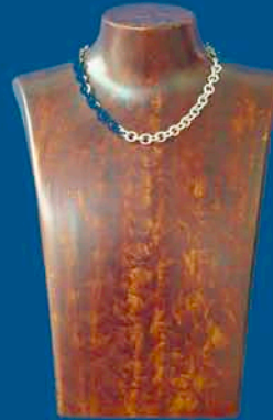
168166B (40X14X28cm) ( 15\frac{3}{4} X 5\frac{1}{2} X 11)