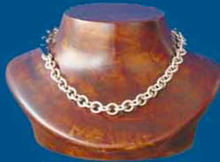
168165B (22X18X14cm) ( 8\frac{1}{16} X 7\frac{1}{16} X 5\frac{1}{2} )