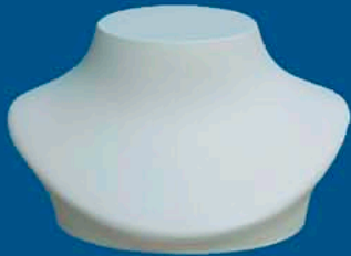
168165 (22X18X14cm) ( 8\frac{1}{16} X 7\frac{1}{16} X 5\frac{1}{2} )