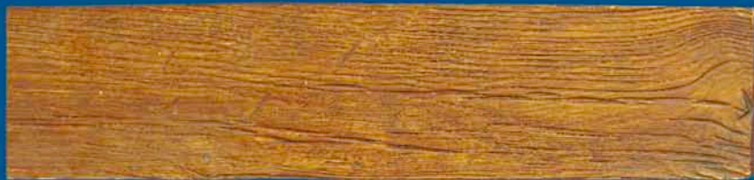
90001 (350X12.5X3.2cm) ( 137\frac{13}{16} X 4\frac{5}{16} X 1\frac{1}{4} )