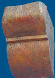
68816 (11X11X13.5cm) ( 4\frac{5}{16} X 4\frac{5}{16} X 5\frac{5}{16} )