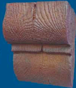
68817 (23X19X18cm) ( 9\frac{1}{16} X 7\frac{1}{2} X 7\frac{1}{16} )