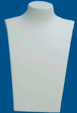
168166 (40X14X28cm) ( 15\frac{3}{4} X 5\frac{1}{2} X 11)